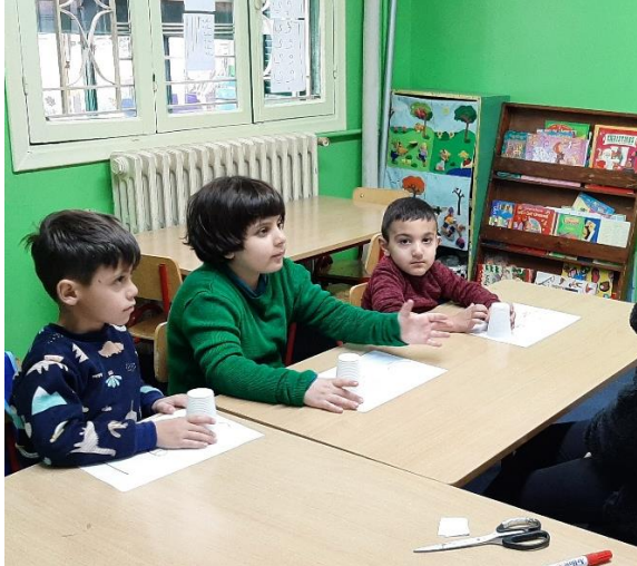
FAID, the school for deaf children in Beirut, was able to start classes again - at last!