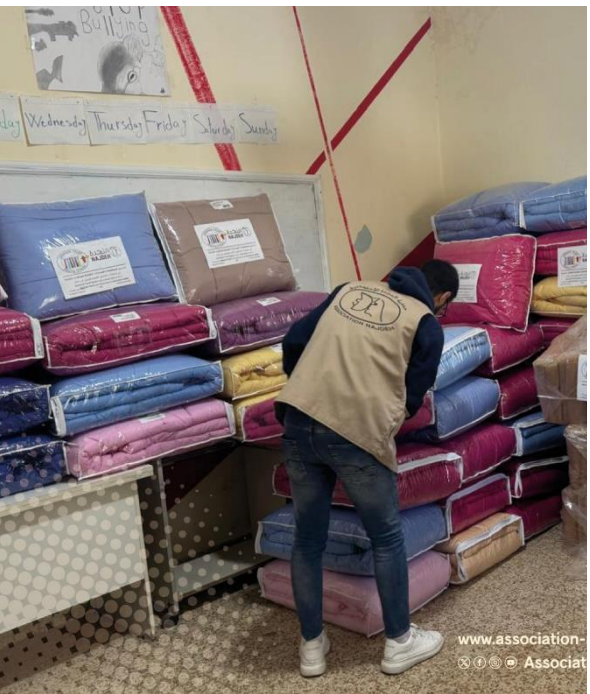
Blankets and other necessities for the displaced, funded by Lebanon Trust and distributed by Najdeh