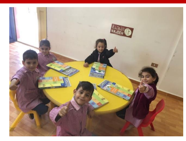
The refugee children with the schoolbooks financed by Lebanon Trust's donors