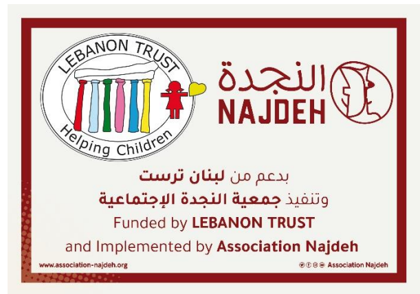
Distribution of food packages in the refugee camps, funded by us and executed by Association Najdeh