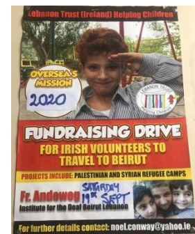
Fundraising drive in Tralee

Donations can be made via the website (credit card, PayPal) or via bank transfer.