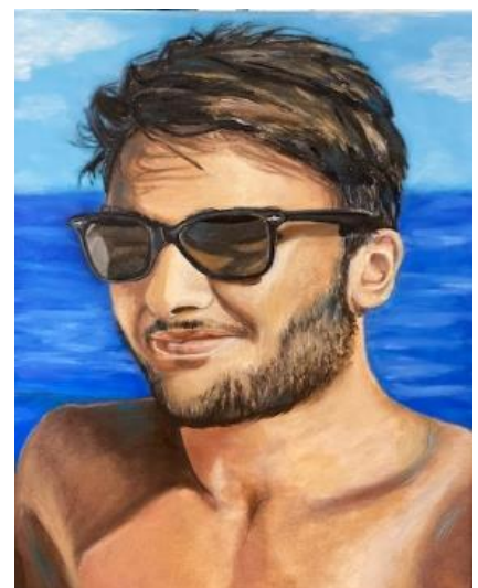
Paintings made on commission by one of our volunteers and sold for fundraising

Donations can be made via the website (credit card, PayPal) or via bank transfer.