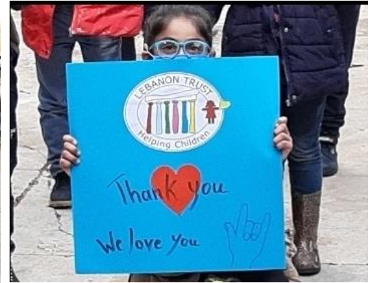
Above: the children display appreciation for Lebanon Trust's efforts