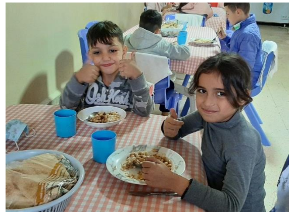
Life at FAID, school for deaf children: in the classroom and at lunch

This year we manage to disburse slightly more than last year, but unfortunately our fundraising did not match the entire sum. It was heart-warming, however, to see that so many friends are very generous. Thank you!